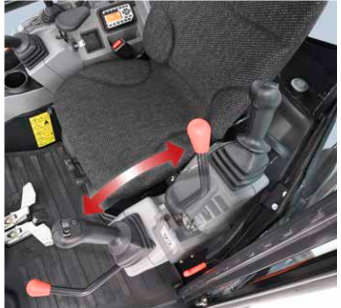
Control stand tilting function