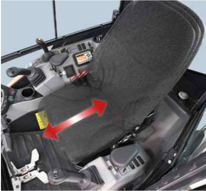
Comfortable sliding seat

The cab space is more comfortable than any other excavator in its class - and the variety of convenient features provide the operator with maximum comfort.