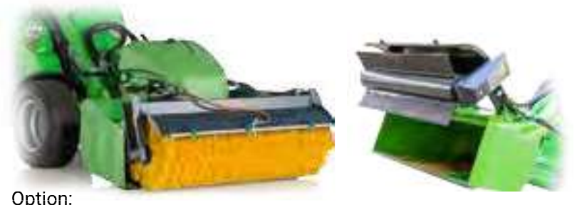
A35956 Water spraying system for Bucket broom 1100 A35807 Water spraying system for Bucket broom 1500 A436108 Rubber blade brush for Bucket broom 1100 A433868 Rubber blade brush for Bucket broom 1500

Water spraying system for dust binding is also available. It minimizes dust build up when brushing dry waste.